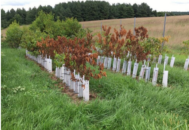
WSSC seed orchard plot 35, killed by PRR in August, 2018.

soil. It can be killed off by prolonged dry periods, very cold temperatures, and by the application of specific fungicides. Previously found only in warm, wet, lowland regions of the south, P. cinnamomi is now being found as far north as Pennsylvania, most likely due to rising temperatures.