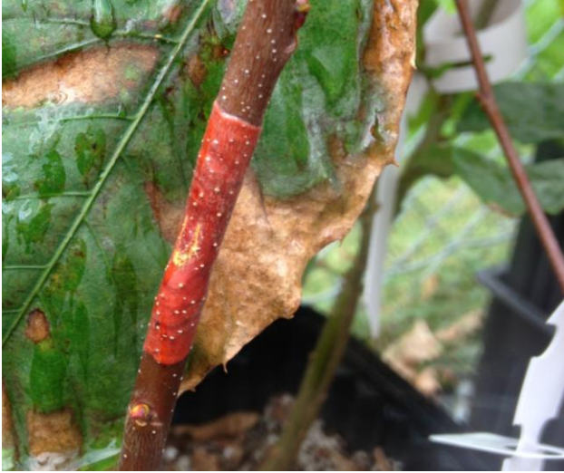
Small stem assay inoculation.