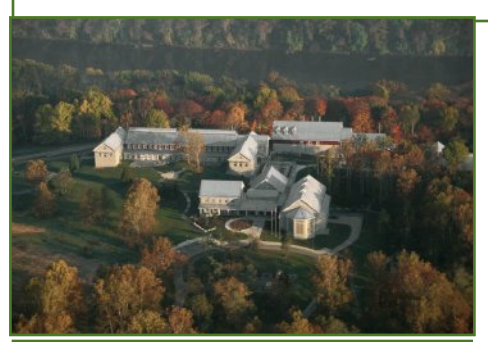
The National Conservation Training Center in historic Shepherdstown, WV.

Links to register online or view the full event brochure are at <a href="www.acf.org">www.acf.org</a>. Full registration (without lodging) is only $75 for TACF members, and day passes (not including meals) are only $40 for members on Saturday, and $25 on Sunday. Filmmakers of The Appalachians will speak Saturday night.