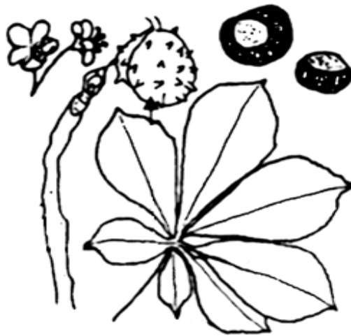
The Horse Chestnut

fat twigs and buds very few spines on the husk of the burr glossy dark brown nuts without a pointed tip like a chestnut 7 leaflets to a leaf rather than one