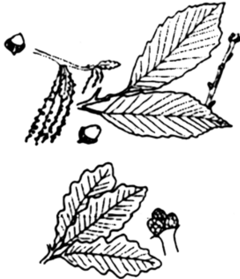
Chestnut Oak & Chinkapin Oak

leaf teeth may be pointed, but never have a bristle at the tip