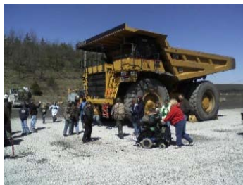
Watch Story Video