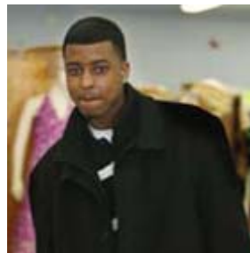
Singing fashion's praises