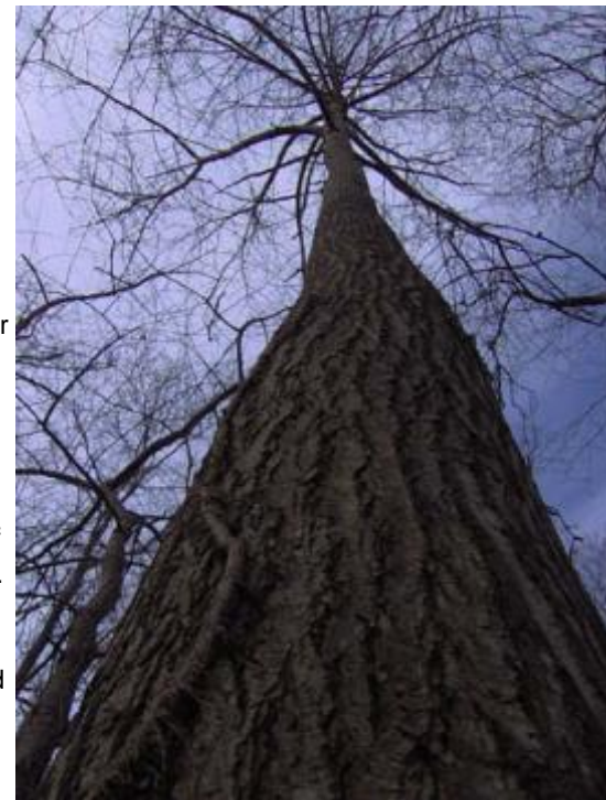
In this photo released by Ohio Department of Natural Resources, the state champion American chestnut is shown during the official measurements by the Division of Forestry Thursday, Jan. 31, 2008 in Sandusky, Ohio. For about seven years, the state's natural resources leaders have harbored a secret. They still won't reveal the exact location of it or allow outsiders to see it. This Ohio treasure's existence was closely guarded until last week when the director of the Ohio Department of Natural Resources revealed that a full-sized American Chestnut tree still stands in a marsh near Lake Erie.

Most surviving chestnut trees are small, sprouting from the roots of trees killed by the fungus.