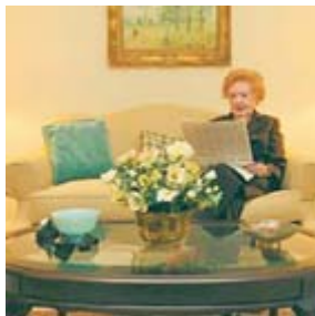
Senior living reborn