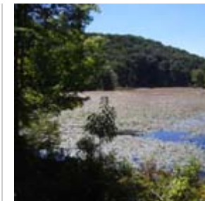
Mountain bike trails, not the water, attraction in southeastern Ohio