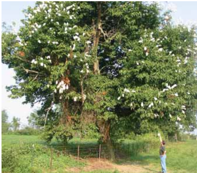
A large surviving American chestnut tree is covered in bags during the controlled pollination process. Some of the larger trees can produce several hundred nuts in a season.

The first step to making TACF's breeding stock is to find American chestnuts with which to cross Chinese and advanced backcross pollen. Whenever a proper tree is found, great efforts are made to incorporate that tree into TACF's national breeding program through the process of controlled pollination. Pollen from the male flower (called a catkin) of one tree is crossed with the female flower (called a bur) of another tree.