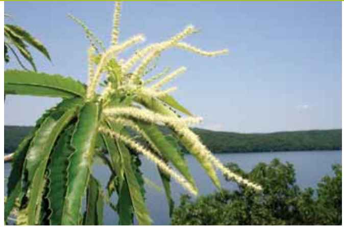
Massachusetts members of TACF not only discovered, but arranged and performed the pollination of this 65-foot tall tree on the Prescott Peninsula of the Quabbin Reservoir. Shown here are the male flowers known as catkins.